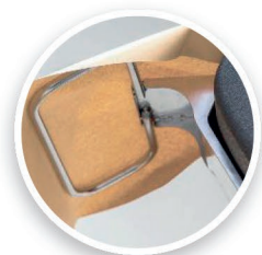
Consistent paper feed mechanism