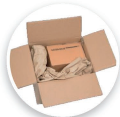
Ri-Fill paper is ideal for various sized items without increasing your carton stock