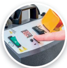
Simple to use length control feature