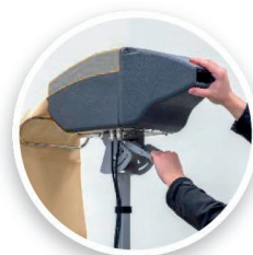
Fully adjustable head to divert the paper