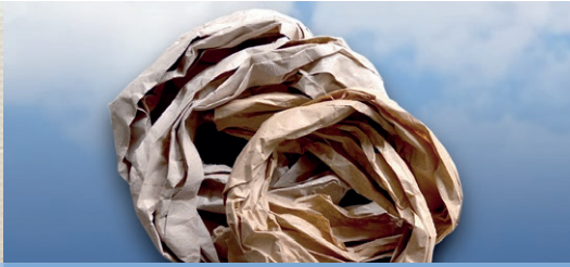
Simple and reliable