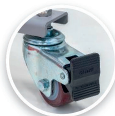
Lockable and secure castors