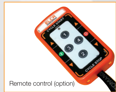
Remote control (option)