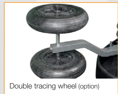
Double tracing wheel (option)