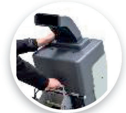
The head position can be altered to dispense the paper where required