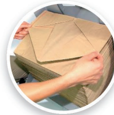
Quick and easy paper reloading

Ri-Pad dispensed cushioning paper offers superior protection and shock absorbency for the safe transit of delicate products.