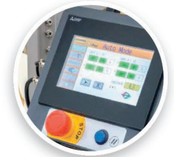
Digital screen control panel