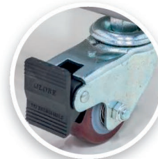
Lockable castors for extra stability