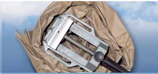
Simple and reliable